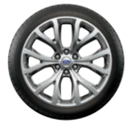
22" Polished Aluminum Included with 302A