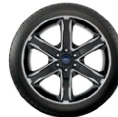
22" Premium Black-Painted Aluminum Included with Stealth Edition, Special Edition and Texas Edition