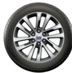
20" Premium Dark Tarnish-Painted Aluminum Standard