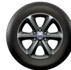
18" Magnetic-Painted Cast-Aluminum Included with FX4 Off-Road Package