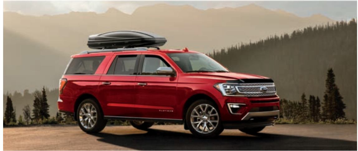
Expedition MAX Platinum in Ruby Red Metallic Tinted Clearcoat accessorized with hood deflector, side window deflectors, 1 splash guards, 1 roof crossbars, and roof-mounted cargo box 1,2

Comparisons based on competitive models excluding other Ford vehicles (class is Extended Utilities based on Ford segmentation), publicly available information and Ford certification data at time of release. Vehicles may be shown with optional equipment. Features may be offered only in combination with other options or subject to additional ordering requirements/limitations. Dimensions shown may vary due to optional features and/or production variability. Information is provided on an "as is" basis and could include technical, typographical or other errors. Ford makes no warranties, representations, or guarantees of any kind, express or implied, including but not limited to, accuracy, currency, or completeness, the operation of the information, materials, content, availability, and products. Ford reserves the right to change product specifications, pricing and equipment at any time without incurring obligations. Your Ford Dealer is the best source of the most up-to-date information on Ford vehicles. Colors are representative only. See your dealer for actual paint/trim options.