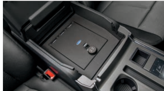
In-vehicle safe 1