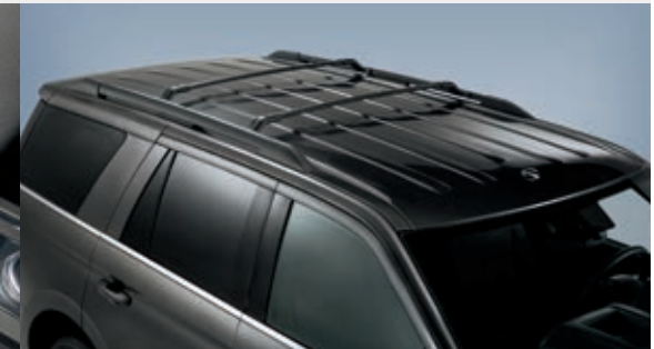
Roof crossbars 2