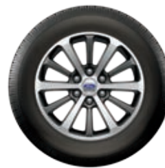
18" Machined-Face Aluminum with Magnetic-Painted Pockets Standard

INTERIORS [L to R]: Ebony Cloth, Medium Stone Cloth, Ebony ActiveX™ and Medium Stone ActiveX