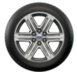
20" Luster Nickel-Painted Aluminum Optional Requires 201A and 202A