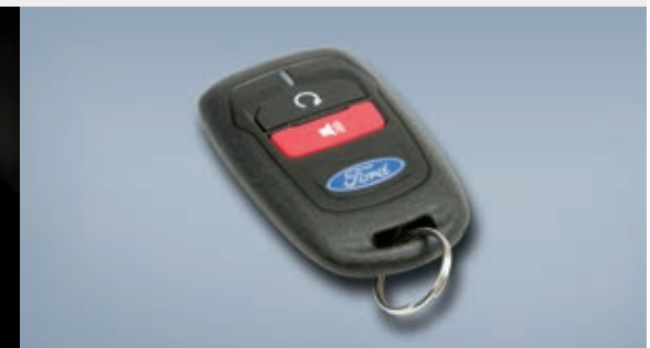
Remote start systems